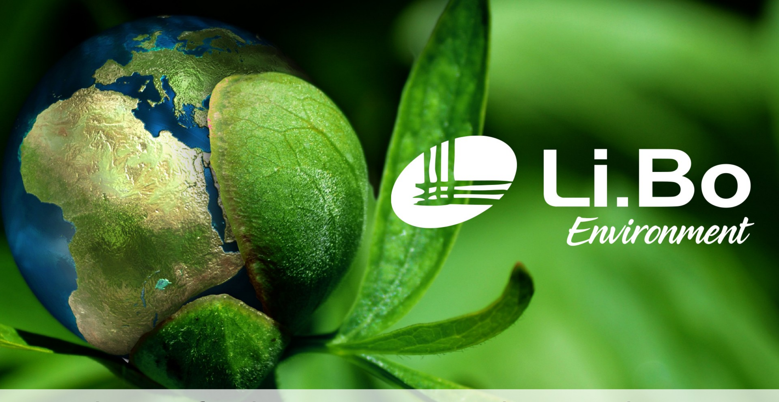
Take care for the environment with Li.Bo. Always.